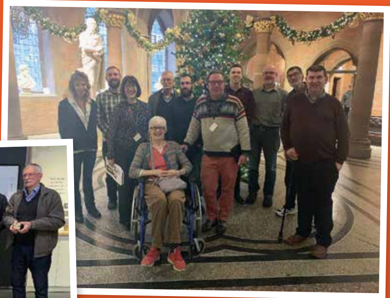
Everyone's a winner!

Our December volunteer day was full of Christmas spirit after our complementary tour around the National Portrait Gallery which included an Ecas Christmas quiz.